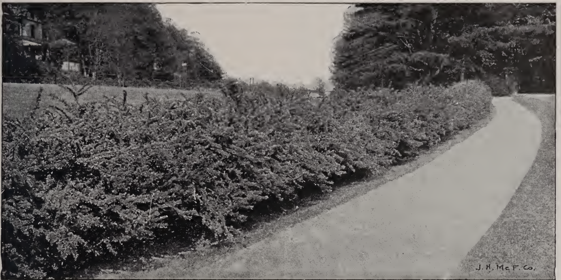
Japanese Barberry ( Berberis thunbergi )